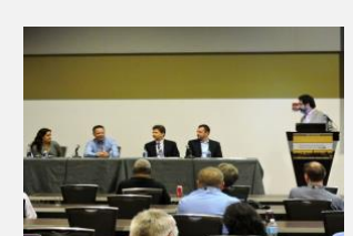
The comprehensive, three-day agenda features 90+ speakers