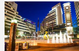
Located in Bethesda, Maryland with access to the best of the DC area.

The Hyatt Regency is located above the Red metro line, offering easy access to landmarks, museums, restaurants and shops throughout the Washington, DC area. Over 600 restaurants, boutiques, and shops are within walking distance.