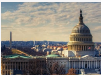
Now in Washington, DC, with easy local and international access