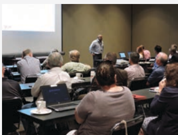
The year's leading event for professionals focused on certified IT security

October 9-11, 2017 ★ Washington, DC ★ www.CertInfoSec.org