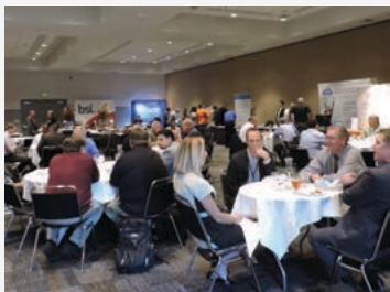
Connect with potential clients during lunches and breaks held in the exhibition area.